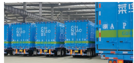
Cainiao can support international express services