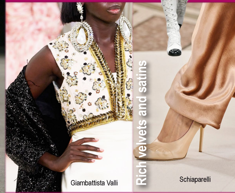
Rich velvets and satins