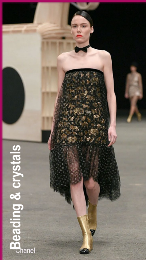
Beading & crystals