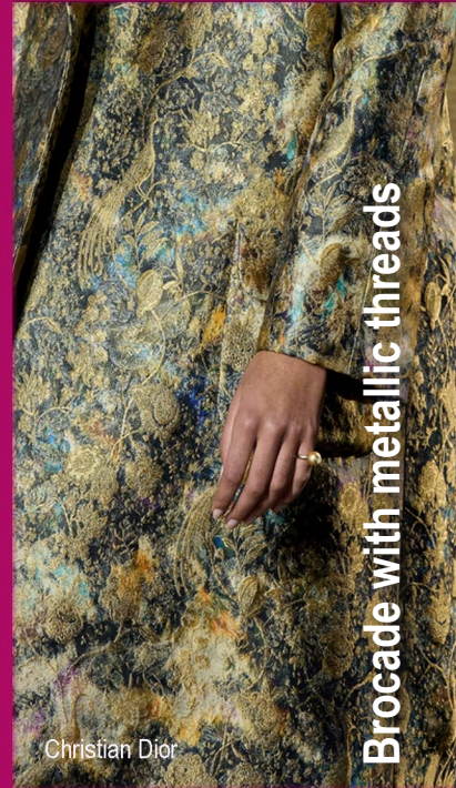
Brocade with metallic threads