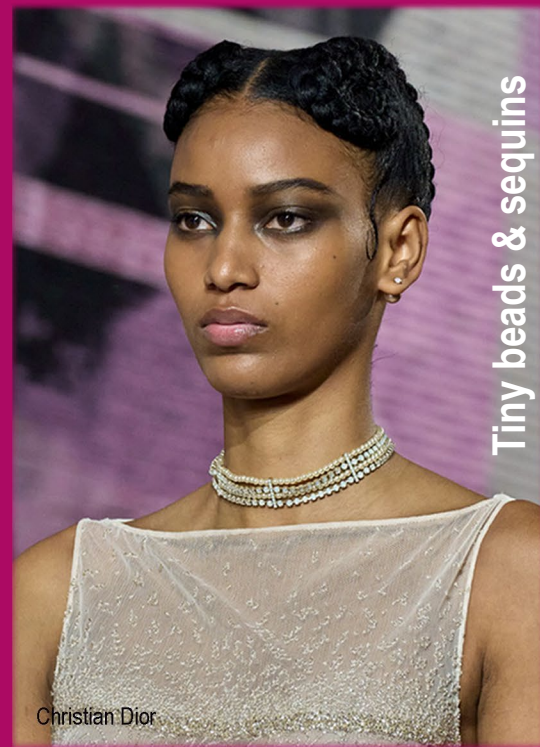
Tiny beads & sequins